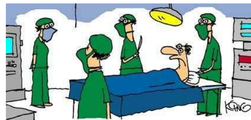
"Nurse, get on the internet, go to SURGERY.COM, scroll down and click on the 'Are you totally lost?' icon."

I am ready to embark on my last year as president and want to hear from practitioners through out the state. Let me know how the ISRC can better serve you.